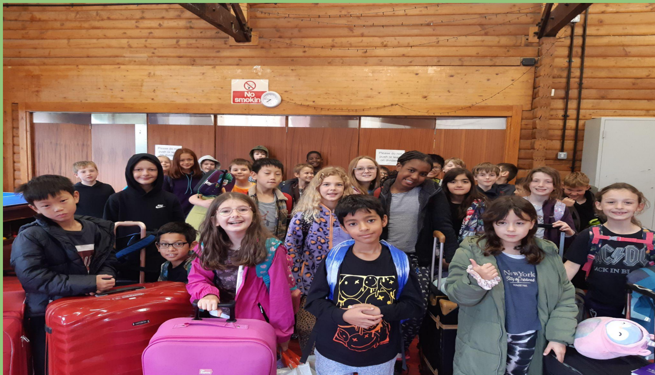
Children return to school on the Friday around 11 - 11.30am.