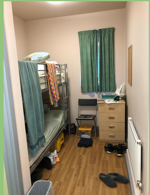
Example of sleeping arrangements