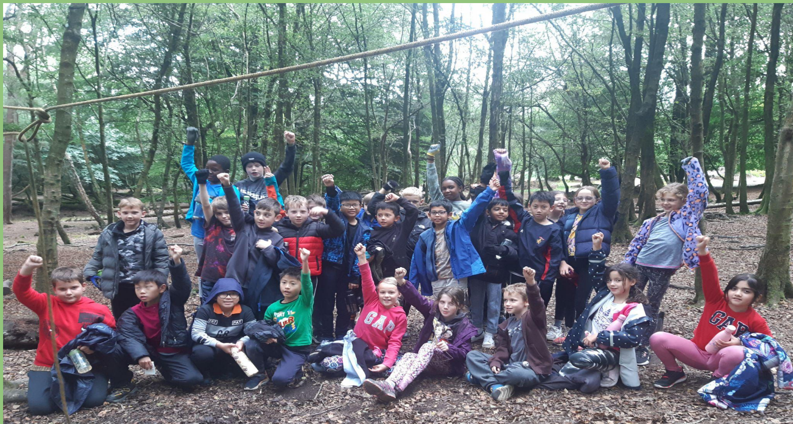
Hindleap Warren 2024 Meeting Tuesday 16th April 2024 9am