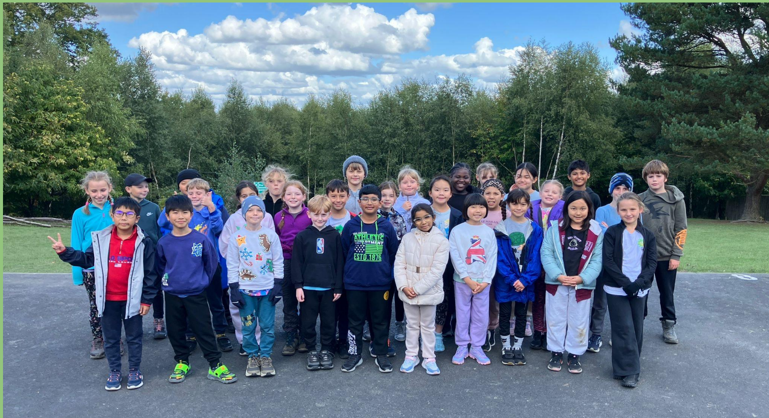
Hindleap Warren 2026 Meeting Tuesday 13th January 2026