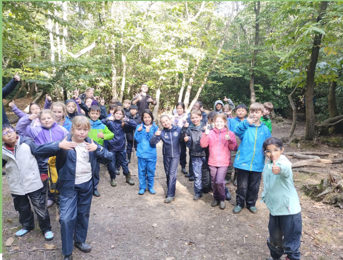
Children return to school on the Friday around 2.30pm - 3pm.